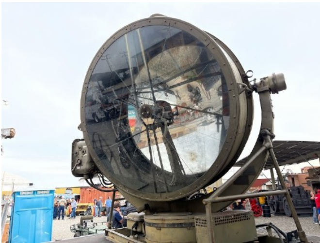
60" searchlight mounted on vintage truck