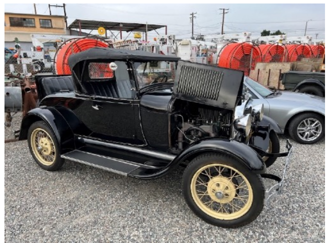
It's a, they're a ...F O R D