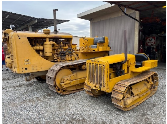
More machinery keeps coming out of the garages