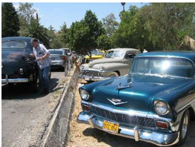
Cars in parking lot