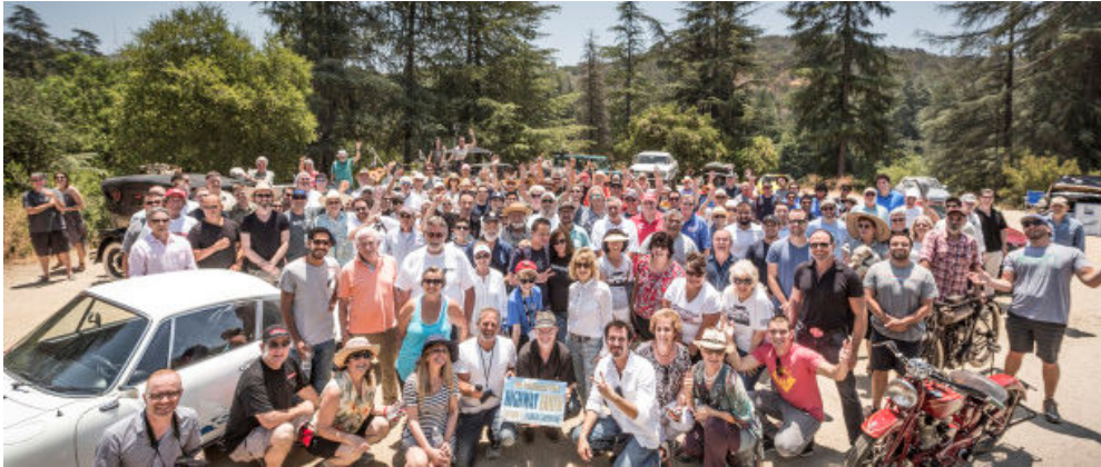
Highway Earth participants pose for the group picture