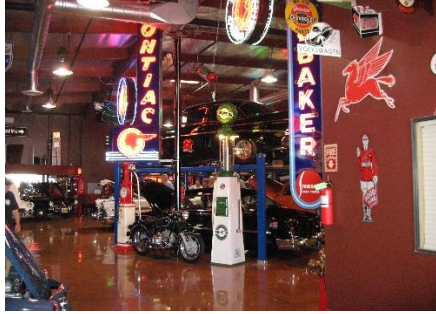
neon signs & double stacked cars