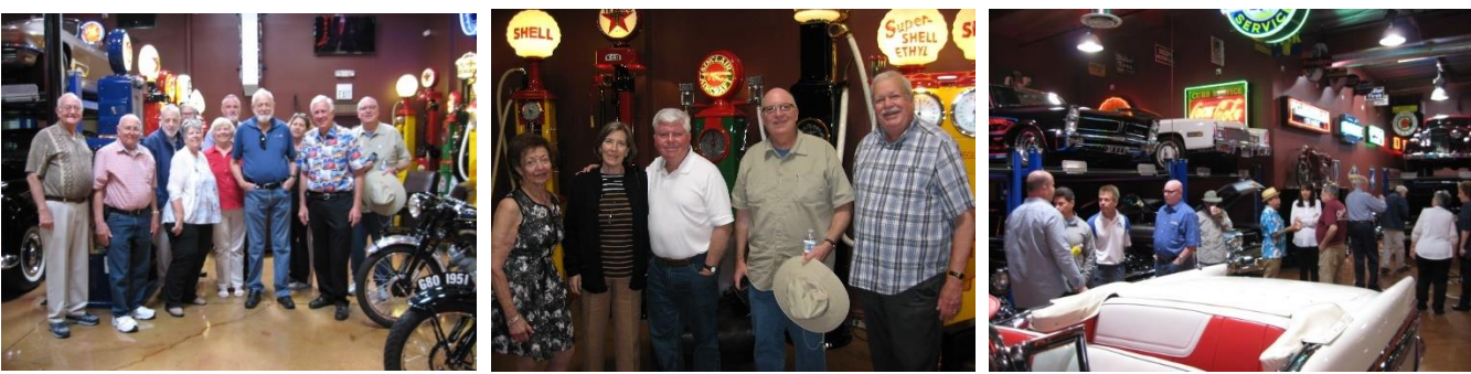
Part of the gang