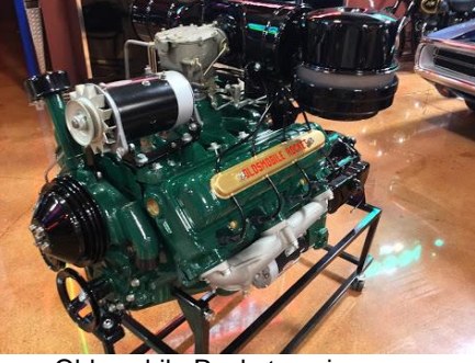
Oldsmobile Rocket engine