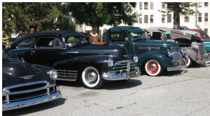
Some of the others cars in attendance

A beautiful, sunny day greeted over 400 Veterans for a patient Barbeque sponsored by the American Legion #46. These Veterans were most appreciative of the live music and classic cars on display. We extend our grateful thanks to all these patriotic men and women for their service.