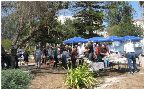
V A Westside Campus