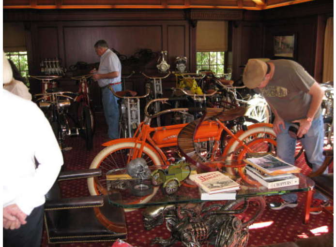
and more on the 2 nd floor

We were invited to see Urban Hirsch III's most astounding collection of early motorcycles and even some related cars. The cycles dated from 1916 and back to their first days. Urban told us the 1916 date was specific to being the cutoff between antique and vintage. Delicately arrayed in a tight space on two floors and hanging from the ceiling are about 150 examples. The cycles included early Sears motorcycles. Sears put its name on everything. Early Harleys, Crockers and even a company called New Era. The names are too abundant to remember. There were two cars built by a company called Spacke (pronounced like Spackey). This company made motorcycle engines. There was also a Stutz, 1903 Cadillac and a specifically abused/neglected looking Model T truck. Urban not only collects motorcycles but he rides them. He said each year he heads to Sturgis for the giant annual get together.