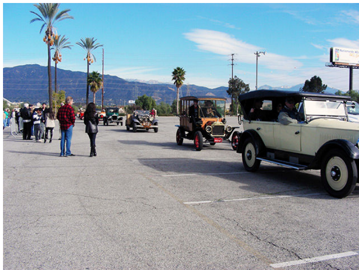
start of the parade of cars on the tour

It is well worth the trip to view these wonderful machines. But, the highlight is the excursion part of the event. This year approximately 140 cars built prior to 1932 paraded out of the Irwindale Speedway grounds to a tour through many towns surrounding Pasadena, Arcadia and San Marino. Of course, stops were made along the way for lunch at the North Woods Inn, shopping at Galcos supermarket and dessert at a private home all of which brought many picture opportunities for amazed onlookers along the way. Be sure to mark this event on your calendar for 2015.