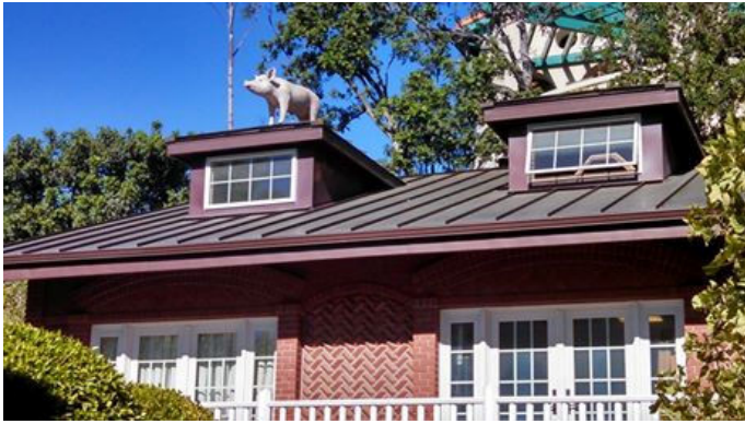
garage roof line