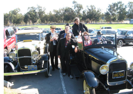
posing for pictures