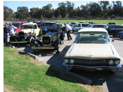
cars on display