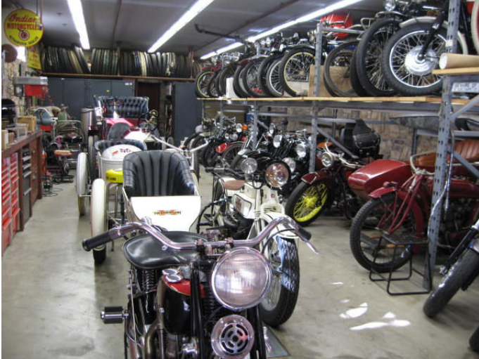
Motorcycles on display