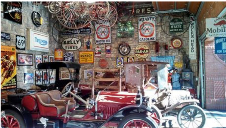
Don't forget to look up

We were invited to see Urban Hirsch III's most astounding collection of early motorcycles and even some related cars. The cycles dated from 1916 and back to their first days. Urban told us the 1916 date was specific to being the cutoff between antique and vintage. Delicately arrayed in a tight space on two floors and hanging from the ceiling are about 150 examples. The cycles included early Sears motorcycles. Sears put its name on everything. Early Harleys, Crockers and even a company called New Era. The names are too abundant to remember. There were two cars built by a company called Spacke (pronounced like Spackey). This company made motorcycle engines. There was also a Stutz, 1903 Cadillac and a specifically abused/neglected looking Model T truck. Urban not only collects motorcycles but he rides them. He said each year he heads to Sturgis for the giant annual get together.