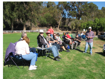
Enjoying the weather