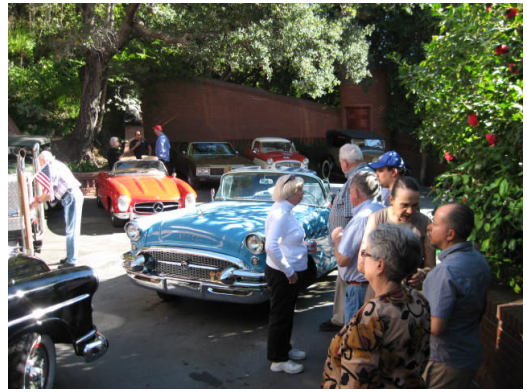
some members & their cars