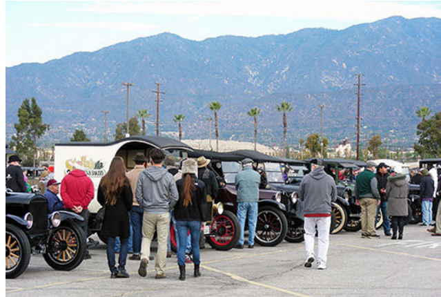
Admiring the many cars on display

It is well worth the trip to view these wonderful machines. But, the highlight is the excursion part of the event. This year approximately 140 cars built prior to 1932 paraded out of the Irwindale Speedway grounds to a tour through many towns surrounding Pasadena, Arcadia and San Marino. Of course, stops were made along the way for lunch at the North Woods Inn, shopping at Galcos supermarket and dessert at a private home all of which brought many picture opportunities for amazed onlookers along the way. Be sure to mark this event on your calendar for 2015.