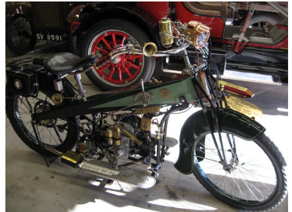
Urban's newest acquisition a Hirsch motorcycle