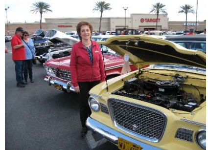
Yes, a winner—brightest yellow

Packards were invited but none were in attendance. Recall that Studebaker & Packard merged in 1954 then, because of financial problems, the Packard marque phased out in 1962. Unfortunately, the Studebaker, known for quality and reliability ceased production in 1966.