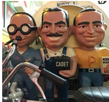
Who are they?