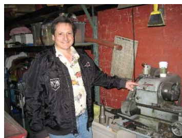
It's a Logan Lathe!