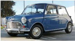
1965 Austin Mini

Plenty of close parking is available for those driving collector cars or daily drivers