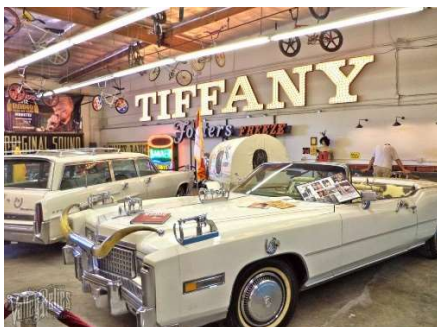
Do you recognize this caddy?