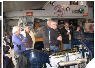
admiring the cars