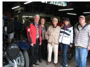
more of the group