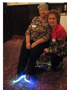
neon shoes & purse