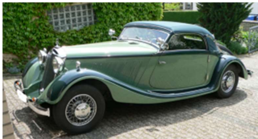
1936 Mercedes Benz

Plenty of parking is available for those driving collector cars or daily drivers