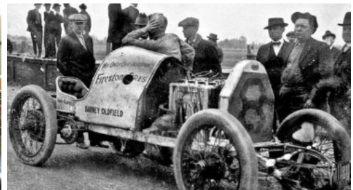
learn about the 1913 Owensmouth Road Race