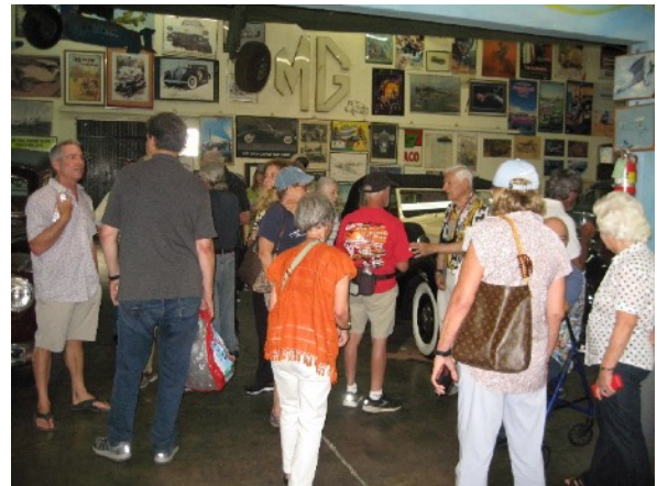
Numerous rooms containing many cars and collectables, it's hard to decide where to look first