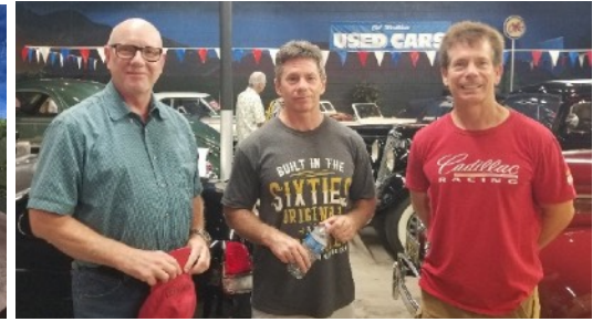
Members enjoying a variety of cars