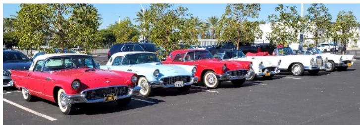
Members drove their collector cars: Model A, Studebaker, T-Birds & Mercedes