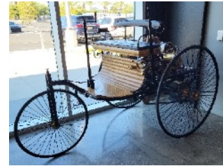
replica 1889 Mercedes Benz