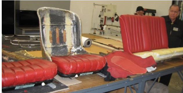
Upholstery Department: leather from special distributor, coconut husk used for foundation with foam for comfort. Each seat sized to owner's specifications.