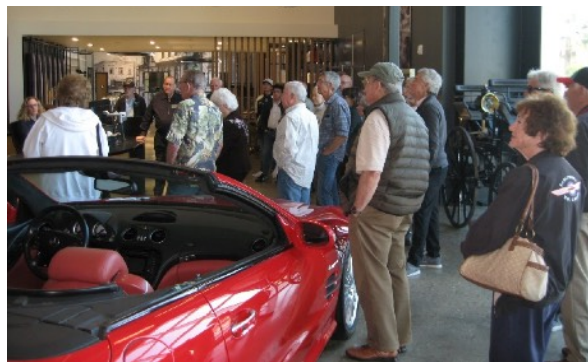
Admiring the classics – Check the trunk--Gullwings supply a mallet for wheel & 30 gallon gas tank for stability. Demonstration of entering & exiting. Notice that if you are over six feet tall, it is not ideal for driving a Gullwing. Oh well, I'm sure someone in the club would be happy to help.