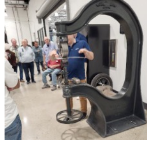
Original hand machines for shrinking, stretching, or bending metal