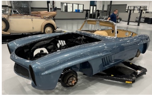
It can take up to five thousand hours or three years to completely restore a Mercedes down to the smallest nut and/or thinnest wire: 1) arrival & initial inspection; 2) tear down & documentation; 3) refinishing & repainting; 4) reassembly & final inspection.