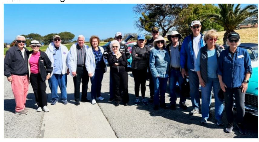
The group assembles for early directions

Present day Palos Verdes is credited to Frank Vanderlip, an innovator in the world of banking who was one of the founders of the Federal Reserve System in addition to implementing the war bond savings stamp program used in World War I & II. Regarded as the "Father of Palos Verdes" Vanderlip purchased the 16,000 acres Rancho de los Palos Verdes in 1913. In 1916 he built the Vanderlip estates near the Portuguese Bend area where some of his descendants still live.