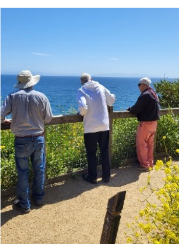
Two miles of panoramic trails hug the coastal bluffs, the beach cove and tide pools

Nestled in a grove of towering redwood trees, the Wayfarers Chapel made of Palos Verdes stone, redwood and glass designed by architect Lloyd Wright was our next stop.