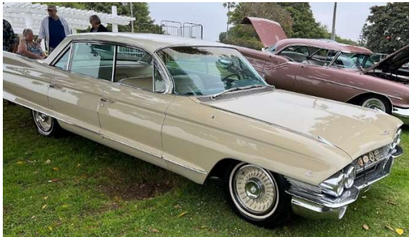
Betsy, you have a flat right rear tire.