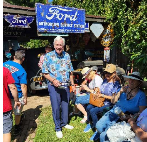
First the introductions then the donuts (or was it vice-versa)