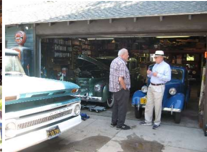
Cars and signs and gas pumps and tools and out-buildings and...