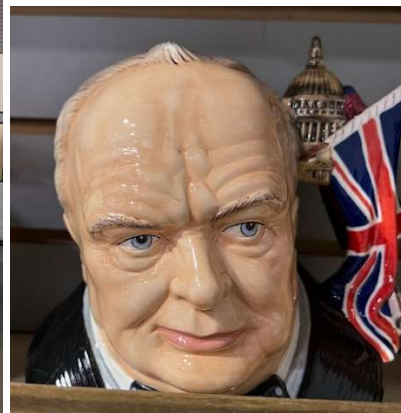
Sampling from the mug collection

Thank you to our gracious hosts who open their private collections of automobiles and petrolinia for our viewing pleasure.