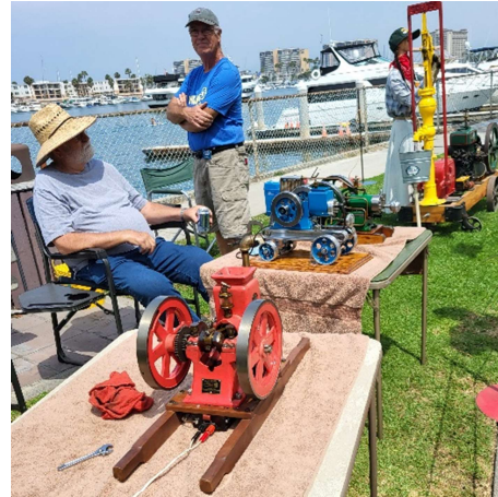
Display of Hit & Miss Engines