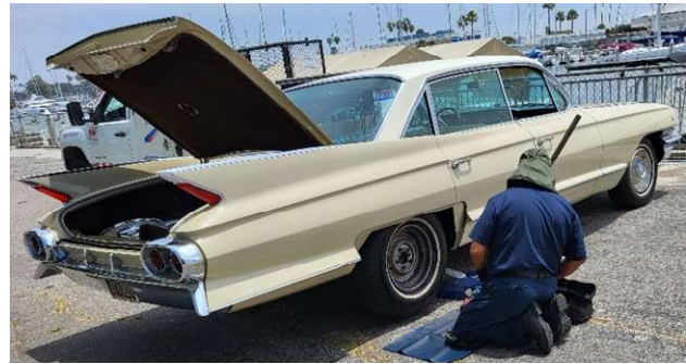
AAA to the rescue!