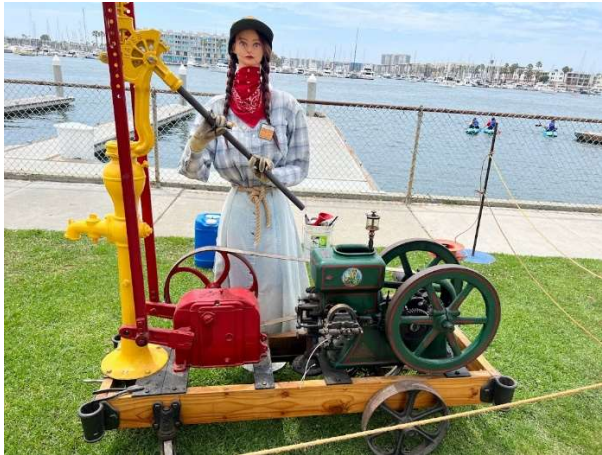
Engine: 1918 1.5 HP Hercules