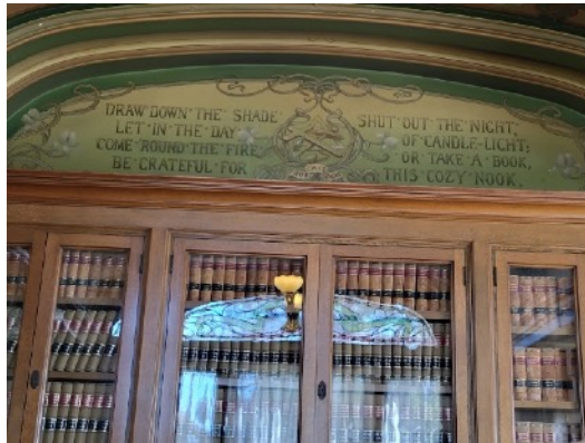
Library message above fireplace