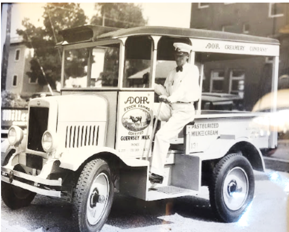
Rindges were original owners of Adohr Farms Named after Rhoda (spell it backward)

Draw down the shade shut out the night Let in the day of candle light Come round the fire or take a book Be grateful for this cozy nook