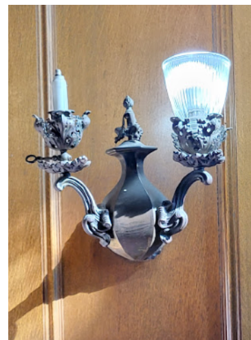
original wall sconce 1 gas / 1 electric