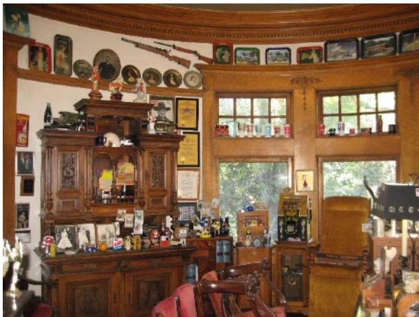
100 year old Coca Cola trays