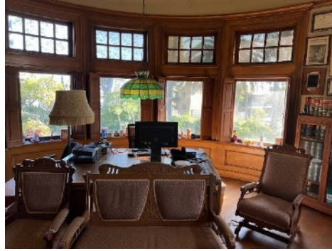
Living room with curved glass windows