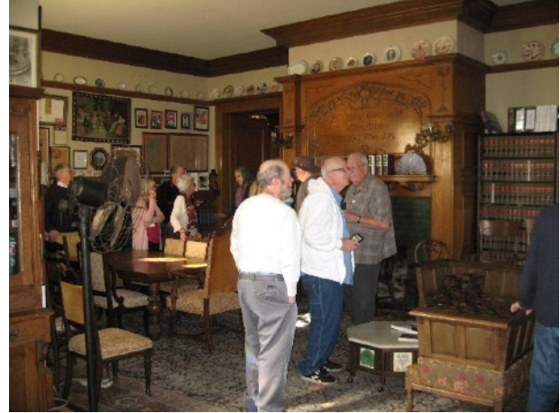
Checking out all the workmanship