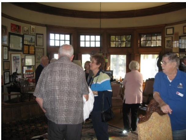
What do you think they see?