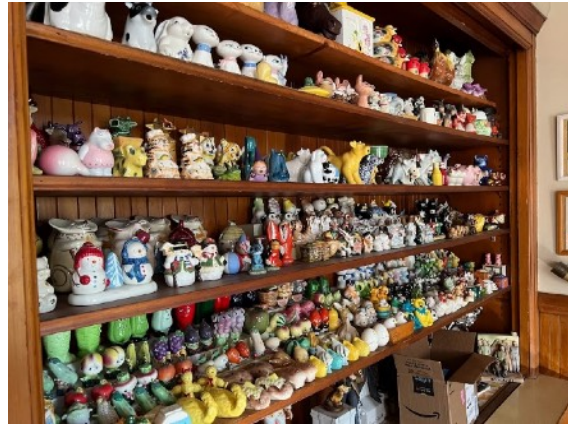
Wall of salt/pepper shakers & pitchers