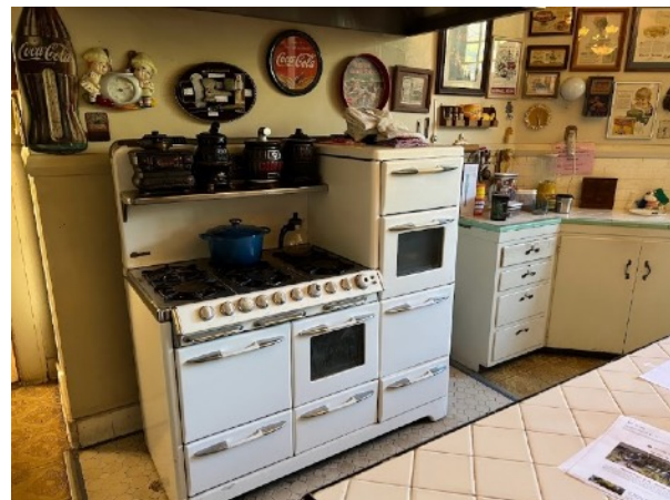
Fully operational kitchen