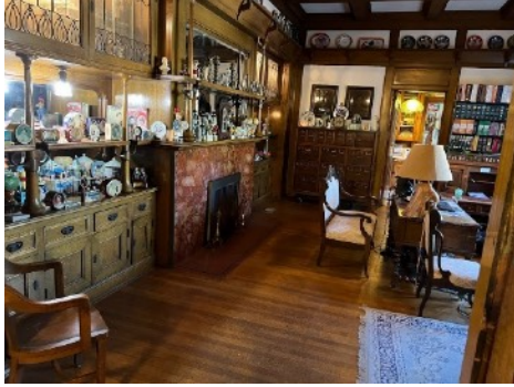
Original dining room