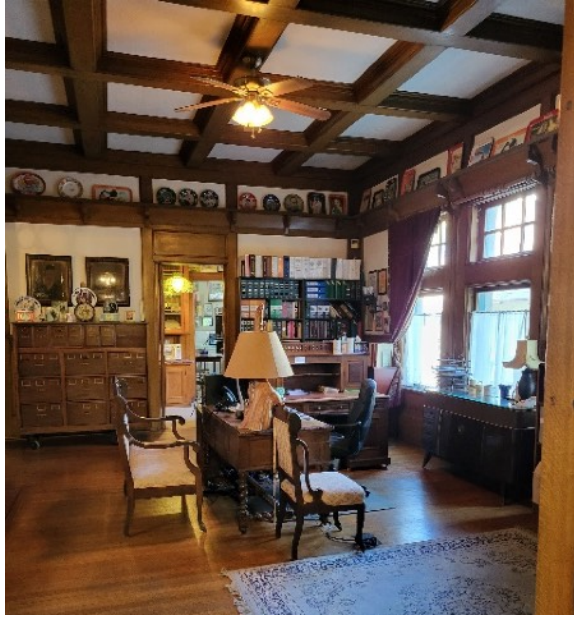
Look at that gorgeous ceiling