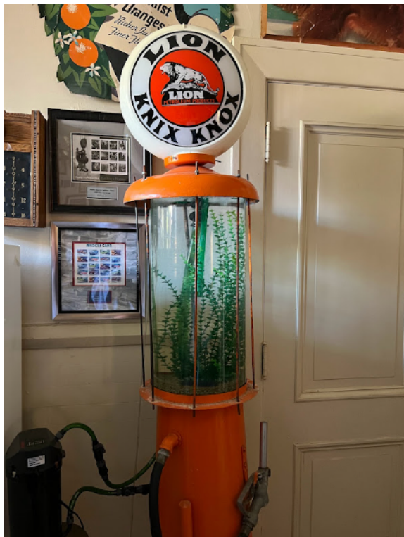
Repurposed to a fish tank