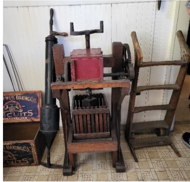
Grape press for wine making