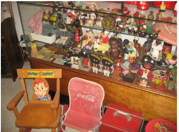
Remember Howdy Doody?