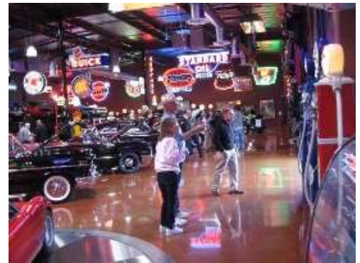
trying to decide where to look first