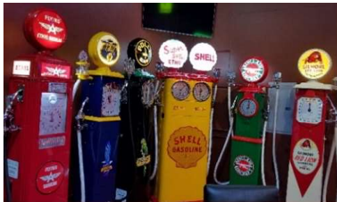
clock face gasoline pumps