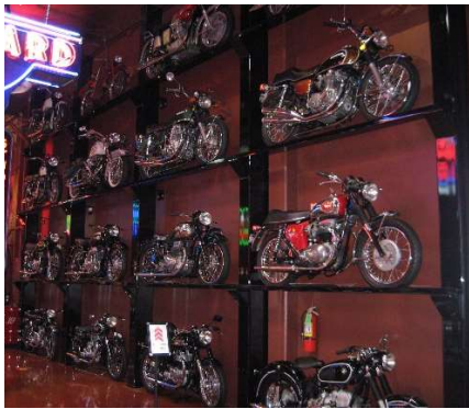
motorcycles adorn a wall

Thanks to the most hospitable hosts, Kip and Amy Cyprus, for an day of unforgettable treats. From the enormous array of automobiles, motorcycles, gas pumps; and vintage gasoline advertising that left our eyes glazed over to the scrumptious crepe feast that satisfied even the most discerning palate.