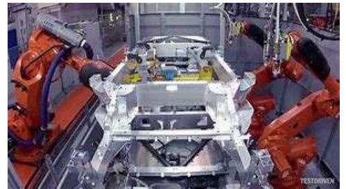
BMW Robots at work

There is a larger VW car museum adjacent to the park. I recommend the tour of the circular car holding towers of finished VW cars waiting for owners to pick up at the factory. The car towers are 2 transparent cylindrical buildings rising 150 feet above the grounds linked by a fully automated delivery system to both the Volkswagen factory and the KundenCenter where VW customers pick up their new cars. The towers are like giant vending machines--when a new car arrives from the factory, it's transported by robot to an empty storage slot in one tower. When a customer shows up, the robotic picking system fetches the car, brings it to ground level, transferring it to the KundenCenter. Each tower holds up to 400 cars on 20 levels and can process a car every 45 seconds during peak times. Take the tour to the top of the tower...amazing!