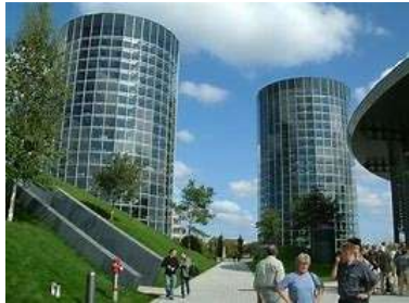
VW—towers of cars

Next I traveled 140 miles to the giant VW Wolfsburg auto production plant with 21,000 employees (said to be the world's largest) and the adjacent "Autostadt" (car city), an open air theme park with individual pavilions dedicated to the family of VW automobiles: VW, Audi, Bentley, Bugatti, Lamborghini, Porsche & Ducati. Autostadt is a gigantic automotive city, the auto version of Disney Land. A Berlin friend and I took the VW plant tour and visited the VW car museum plus several of the VW car brand corporate pavilions. Plan on spending the better part of a day at this venue.