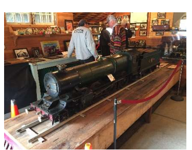
Inside the Barn