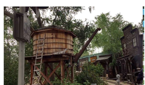
Scenery on the 1-1/2 mile ride