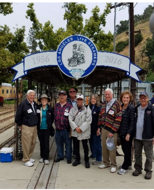
Some of the gang