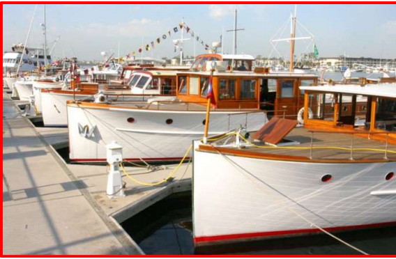
walk aboard magnificent yachts

Join the Classic Yacht Association and the Antique Automobile Club for an Old Fashioned Day in the Park Reliving the days of spirited yachts and classy cars Free Admission