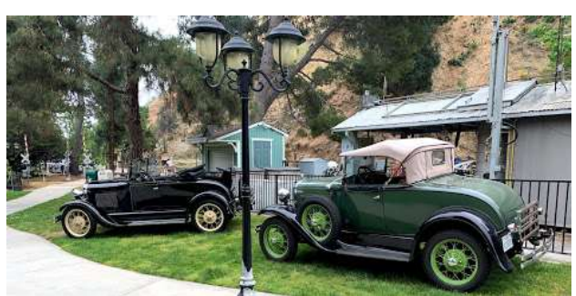
AACA Cars in the Park