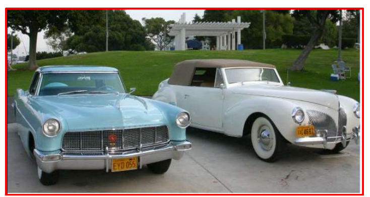
View the array of collector cars

Sunday July 28, 2019 10:00 am to 3:00 pm Burton Chase Park 4701 Admiralty Way, Marina de Rey