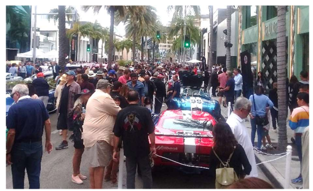
Crowds of viewers

For the past twenty-six years, the Rodeo Drive Concours d'Elegance has grown into a beloved tradition for families celebrating Father's Day. In fact, the Rodeo Drive Concours is the largest public event held annually in Beverly Hills, thanks to the continuing commitment and generosity of enthusiastic car owners who share their cars with over 35,000 visitors a year.