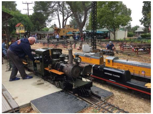
I've been working on the railroad