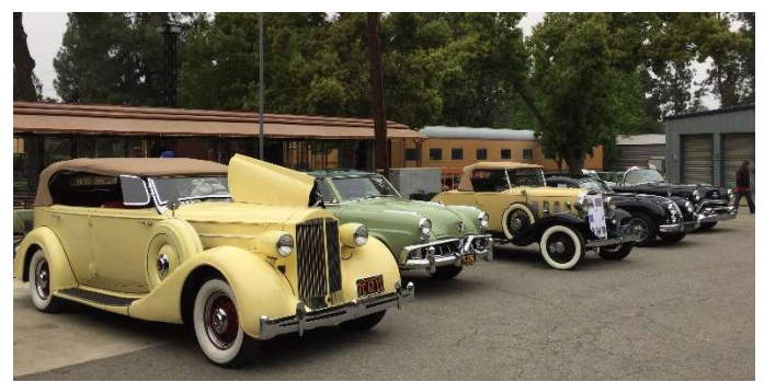
AACA Cars on display - Packard, Studebaker, Chevrolet, Oldsmobile, T-Bird, Model A

The Los Angeles Live Steamers Club invited AACA SoCal to participate in their open house featuring ride-on trains, classic cars, tractors and hit-and-miss engines. While the public rode the perimeter of the park to view the collection, our club had a dedicated train whereas were able to roam the grounds chatting with the many members working on their machines. The Disney Barn was opened for our pleasure with Docents answering our many questions. The Live Steamers have invited us back for next year's event – a must for the inquisitive mind of all ages awaiting a fun afternoon!