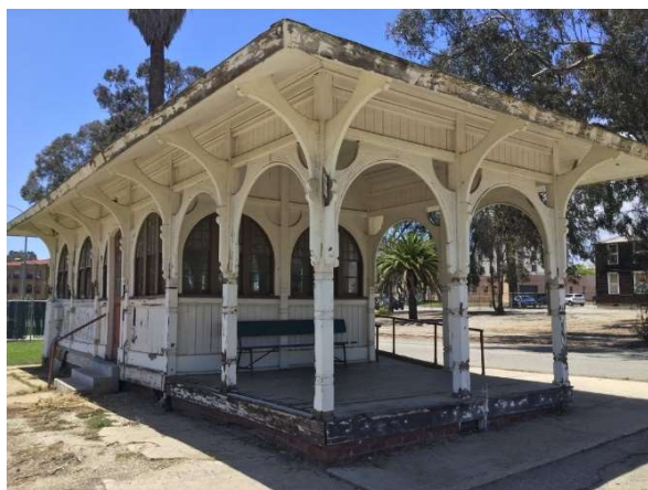
Red Car Depot

The Veterans at the WLA VA Campus were treated to a car show, BBQ lunch and entertainment.