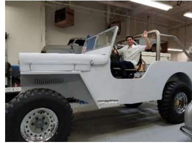
Oops, I shrunk my grandson