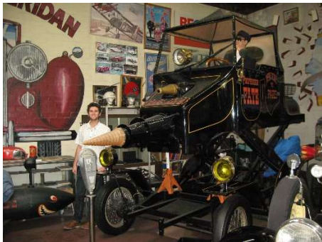
Professor Fate, I presume