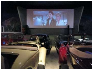
"Grease" on the big screen